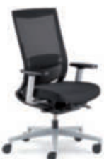
Swivel chair mesh backrest cpn88 4F arm supports, aluminium base alu-coloured.