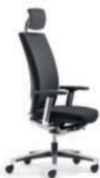
Swivel chair upholstered backrest cpl99 with neck support, 4F arm supports, polished aluminium base.