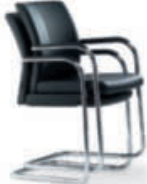
Cantilever conference chair cca58 chrome-plated frame, also stackable.