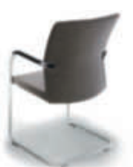
Cantilever conference chair cca58 high continuous back, alu-coloured frame.