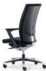
Swivel chair upholstered backrest cpl98 Z-armrests, polished aluminium base.