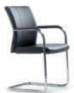
Cantilever conference chair cca58 high continuous back, chrome-plated frame.