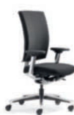
Swivel chair XS-XL (NPR) upholstered backrest cpl67 with MF arm supports, polished aluminium base.