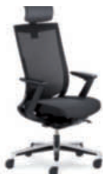
Swivel chair mesh backrest cpn89 with neck support, Z-armrests, polished aluminium base.