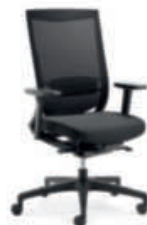
Swivel chair mesh backrest cpn88 height-adjustable armrests, polyamide base L.