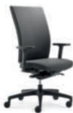
Swivel chair upholstered backrest cpl98 3D arm supports, polyamide base L.