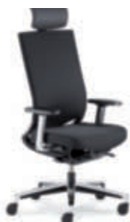
Swivel chair mesh backrest with upholstered pad backrest cpn99 with neck support, Z-armrests, polished aluminium base.